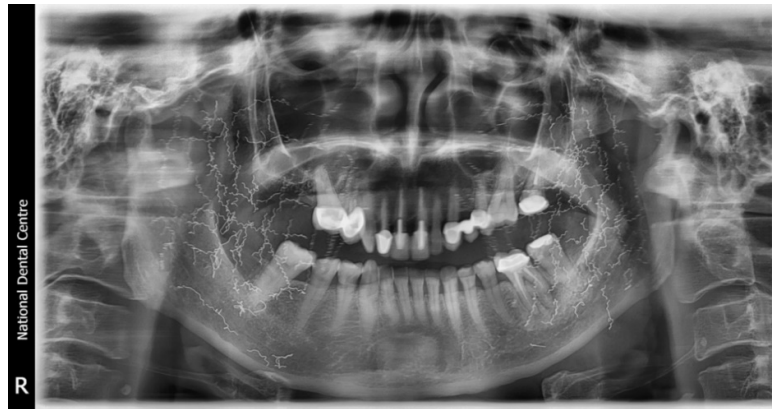
Fig. 1. Panoramic radiograph showing multiple, filamentous, springy radio-opacities of varying lengths, criss-crossing haphazardly; observed bilaterally in the region of the mandibular rami and posterior teeth