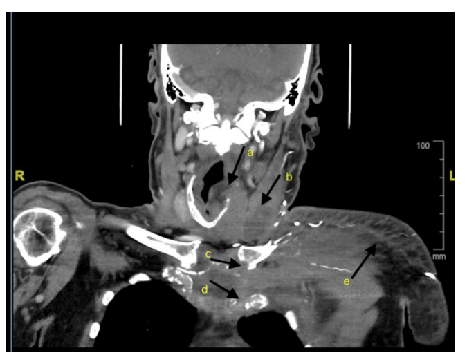
Fig. 2. Coronal, contrast enhanced computed tomography showing a) thyroid cartilage erosion with mass effect causing narrowing of airway. b) left SCM multiloculated enhancing collection with no clear fat plane with adjacent left thyroid lobe. c) bony erosion of medial part of left clavicle. d) bony erosion of manubrium sternum and first rib. e) diffuse subcutaneous edema at left chest

Presentations of lymph node metastasis as deep neck abscess or cervical cellulitis is uncommon and maybe secondary to the relatively effective blood supply to the head and neck area [9]. It has been hypothesized that infected ulcer from the primary tumour is a probable source of the abscess forming bacteria, which then drain into the lymph nodes [10].