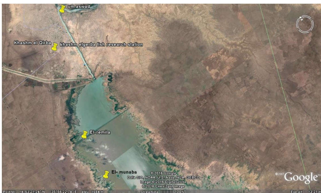
Plate 1. A map of Khashm El-Girba reservoir, Atbara River and the sampling sites

Body weight (BW) was measured by digital balance (Electronic Scale, Sensor Disc, SF-400), to the nearest 0.0 g.