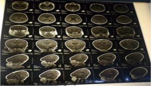
Fig 2. Magnetic resonance imaging of the patient's brain and orbit