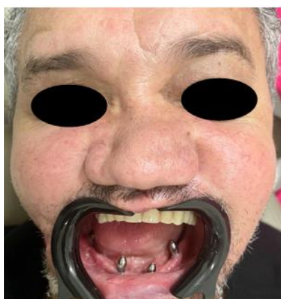
Fig. 5. Pré final prosthetics rehabilitation