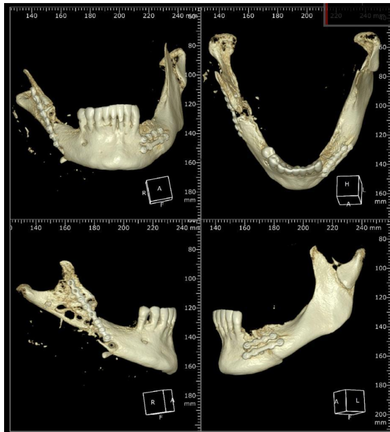
Fig. 3. Nonunion of the mandibular corpus (right side) and malunion of mandibular parasymphysis (left side).

The implants were positioned in the right and left zygomatic bone, using four conventional 4x17mm morse cone implants (two for each side), with 80N locking and Implacil Z-arm® – FACCO technique (with movement above 180°). (Fig. 4). Pilar Z comprises three parts: 1) a morse taper implant; and 2) a Z-angled pillar with a length of 18mm. At one extremity, it contains an internal morse taper connection without indexing; at the other, it includes a connection with a 12-mm internal thread. There is also a passant screw of 1.4-mm diameter and; 3) a 15-mm long rod, with a 10-mm thread at one end that connects to part 2. It contains a self-threading nut for height delimitation and an external hexagon prosthetic platform with a height of 0.7mm [9]. Due to the absence of a maxilla, it was impossible to follow the complete Technique and place the two anterior implants to avoid the cantilevering of the prosthesis.