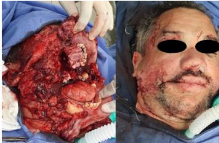
Fig. 1. Emergency service (before x after surgery).

the first hospital in Rio de Janeiro, Brazil (Fig. 2). He remained in the intensive care unit for a month and presented psychomotor agitation generated by the discontinuous use of amphetamines due to his profession (truck driver). In fact, for the first surgery, the only exams available to the patient were two-dimensional images (panoramic radiography and lateral telerradiograph).