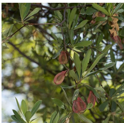
Fig. 1. Leaves and fruits of Terminalia sericea