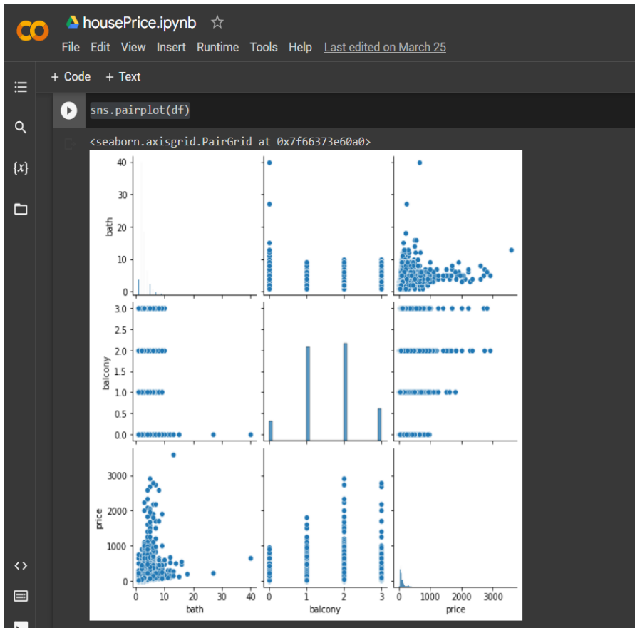
Fig. 3. Exploratory Data Analysis