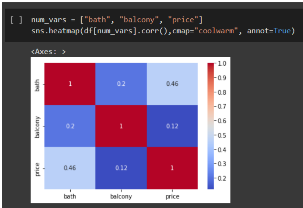
Fig. 4. Correlation heatmap