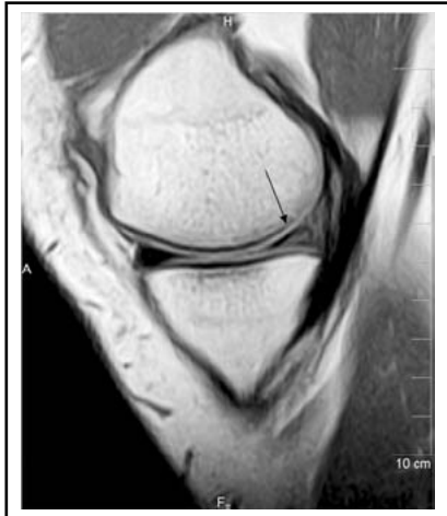
Fig.2: Sagittal T1-weighted MR image showing Grade-3a tear in the posterior horn of medial meniscus that extends to the inferior articular surface. (Black arrow) On arthroscopy the tear was not documented performed 14 days after MR imaging.

single MR slice and not on two consecutive images. Since the number of patients with grade-3 tears was small statistical values were not calculated for tears diagnosed by two consecutive MR sections as variations were expected by random chance in the calculation of accuracy values.