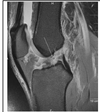
Fig.3: Sagittal TE weighted MR image reveal what was thought to be complete ACL rupture (arrow) was not appreciated as a complete rupture at arthroscopy. According to the arthroscopist it was a partial tear that involved approximately 75% of the ligamentous body.

and clinical examination both provide accurate non-invasive information for diagnosing menisci and the ACL injuries. 10 Diagnostic arthroscopy is used to clarify doubtful cases of meniscal tears. Unfortunately, it is an invasive procedure with possible problems and risk to the patient. Its overuse can result in unnecessary complications, such as sephenous and peroneal nerve injuries, superficial and deep infections, vascular injuries and pulmonary embolism. 11