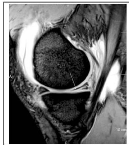
Fig.1: Sagittal T2-weighted MR image revealing grade-3 tear in the posterior horn of medial meniscus. Linear hyperintense signal (arrow) seen extending to the inferior articular surface. Joint effusion also seen in the image.

In 19 out of the 20 patients with confirmed grade-3 tears on arthroscopy, abnormal signals reaching the articular surface were seen on two consecutive MR sections. Only one patient with confirmed grade-3 tear on arthroscopy showed abnormal signals on