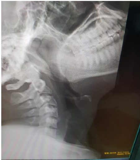
Fig. 3. Showing normal radiograph of the lateral neck

Kappa Agreement= 0.83 (95% Confidence Interval: 0.52-1.00)