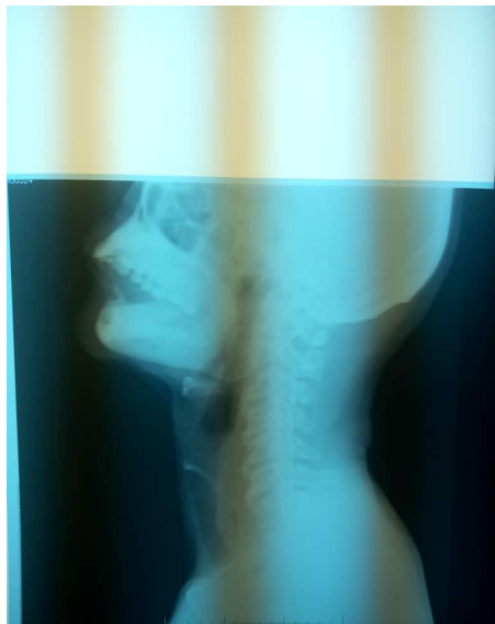
Fig. 4. An adult male with swallowed denture

Note: The loss of normal cervical lordosis, the widened prevertebral space with entrapped air around cervical spine 6 and T1. The denture is radiolucent, therefore not seen. However the air entrapment is an indication of the location