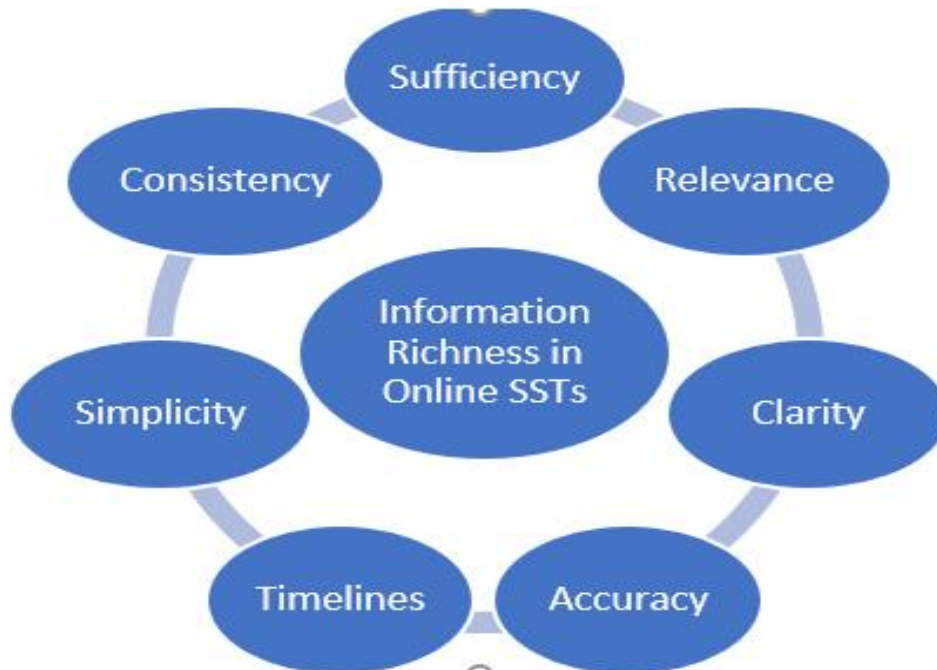
Fig. 2. Elements of information richness in online based SSTs

This study was limited to exploring elements of information richness in online based SSTs. The future researchers can extend the investigation to study the influence of information richness on customer acceptance, use and experience of using such online based SSTs.