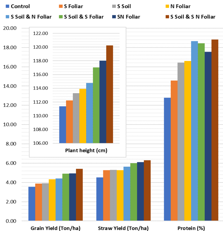
Fig. 1. The effect of pre-planting sulfur (SS) and foliar sprayed sulfur-nitrogen (FSN) across cultivars on grain yield (ton ha -1 ), total protein content (%), straw yield (ton ha -1 ) and plant height (cm)