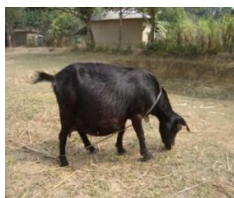
Fig. 1. Solid black