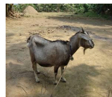
Fig. 4. Brown bezoar

Bhaluka Upazila in Mymensingh district of Bangladesh under a completed project named “UNEP-GEF-ILRI FAnGR Asia Project” conducted from 2009 to 2013.