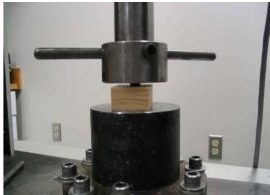
Fig. 3. Determination of Hardness using Janka tester

A Janka hardness tester with a modified, diameter 11.3 mm ball (projected area 1 cm 2 ) was used to determine the hardness of specimens. One centralised penetration was made on the tangential and radial face by continuously applying the load at a rate of 6.6 mm/ min. The load at which the ball attained half its penetration was recorded as the hardness (N) of the wood specimen.