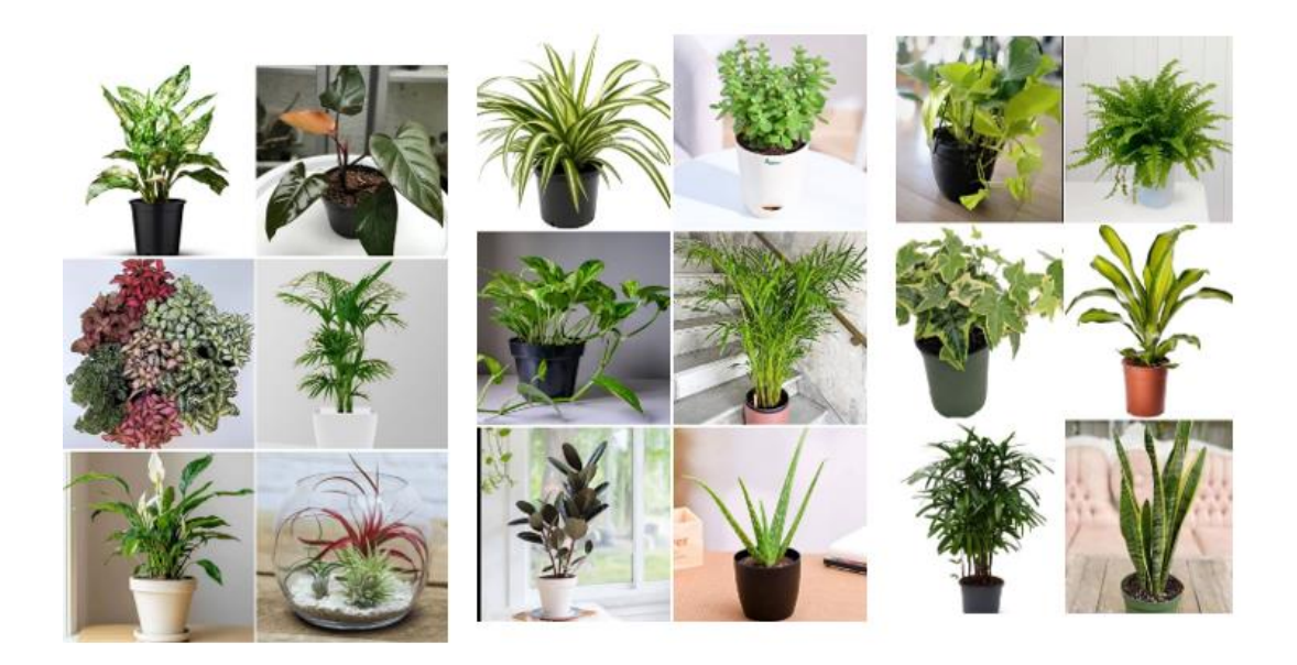
Fig. 2. Photographs of indoor plants